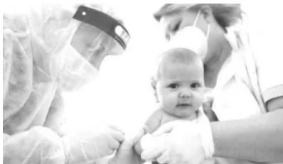
The Vaccine (Dis)Information War February 23, 2021 In "Health"